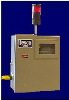
Shown w/Optional Fluid Pressures Transducers