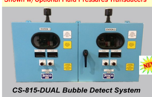
CS-815-DUAL Bubble Detect System