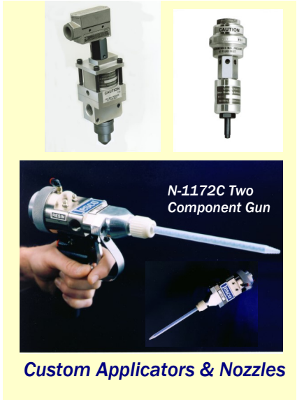
N-1172C Two Component Gun