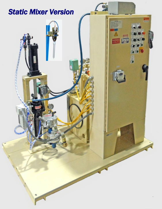
Static Mixer Version