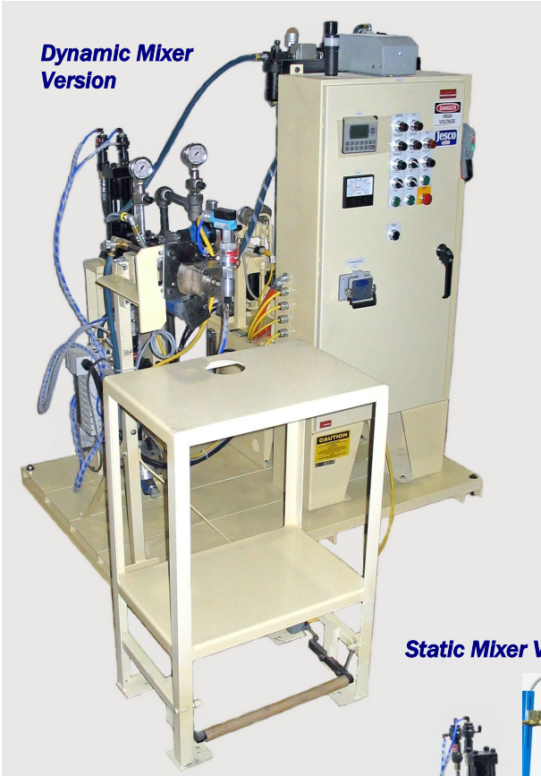
Dynamic Mixer Version